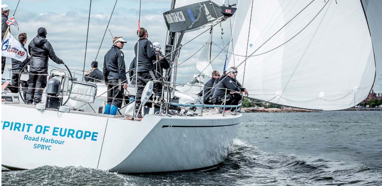
Gazprom-sponsored yachts take part in European races to promote the firm